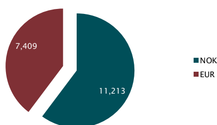
Issues by currency, 2013 (in NOK million)